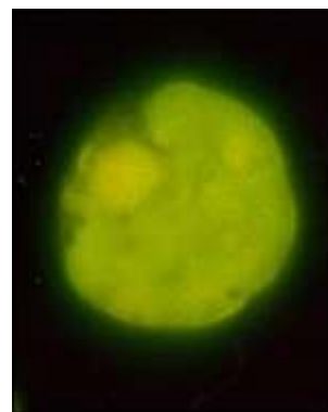
Some of the experimental cells have strange internal structures

This produced solid materials which, when immersed in water, spontaneously created soap bubble-like membranous structures that contained both an "inside" and an "outside" layer. The structures themselves are not alive.